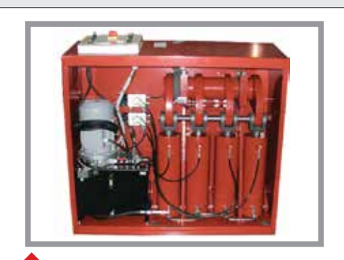
Exclusive "Volumetric" Control - 220v 1 phase