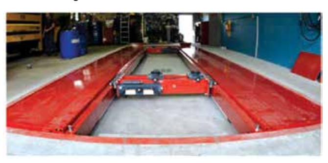
Optional Flush Mount, Drive Through or Service