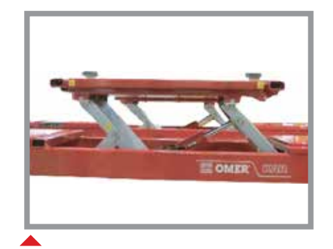
9,000 LB. (4.1T) Expandable (up to 10' wheel base) Lifting Tables