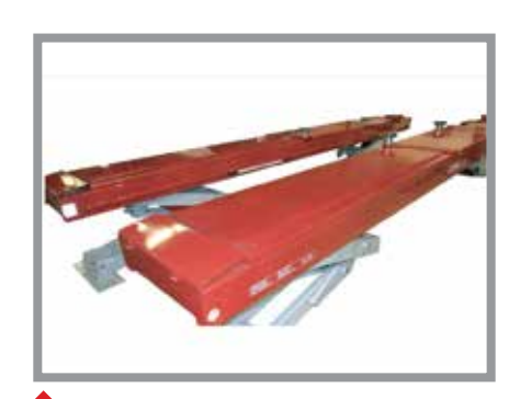
Built in Pneumatic Rear Slip Plates