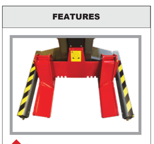
Low Profile Adjustable Forks